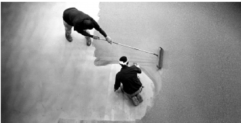
Workers with Covington Floors in Birmingham apply a rubberized surface to the flooring at McCarthy Gym. The new surface is one of the last steps completed as the gymnasium is transformed into the MSU tennis team's new indoor facility.