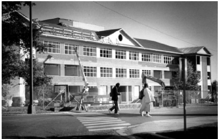
Pedestrians weave their way around Hilbun Hall.