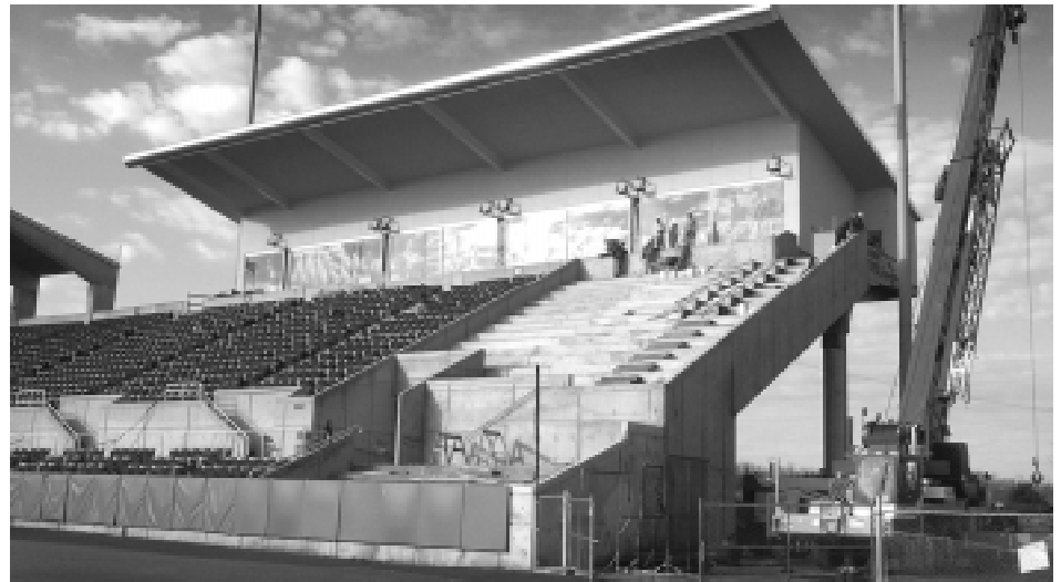
An extensive expansion project at Dudy Noble Field, Polk-DeMent Stadium is nearing completion. More than 600 additional chairback seats and 18 skyboxes are being added to a facility rated by Sports Illustrated as the best place to watch college baseball. With the additions, fixed seating capacity will be nearly 7,000.

For more information, access the ITS web site or telephone 325-0631.