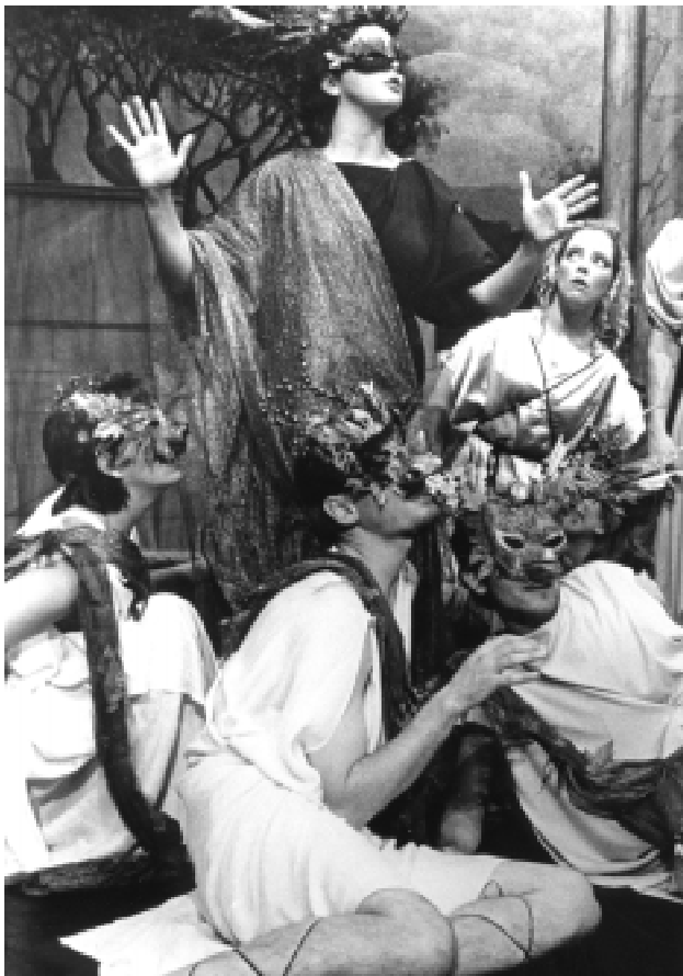
The cast of Shakespeare's "A Midsummer Night's Dream."

For more information, telephone 325-4201 or visit the Lyceum web site at < www.msstate.edu/dept.lyceum >.